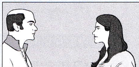
They're looking at each other .