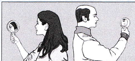
They're looking at themselves .